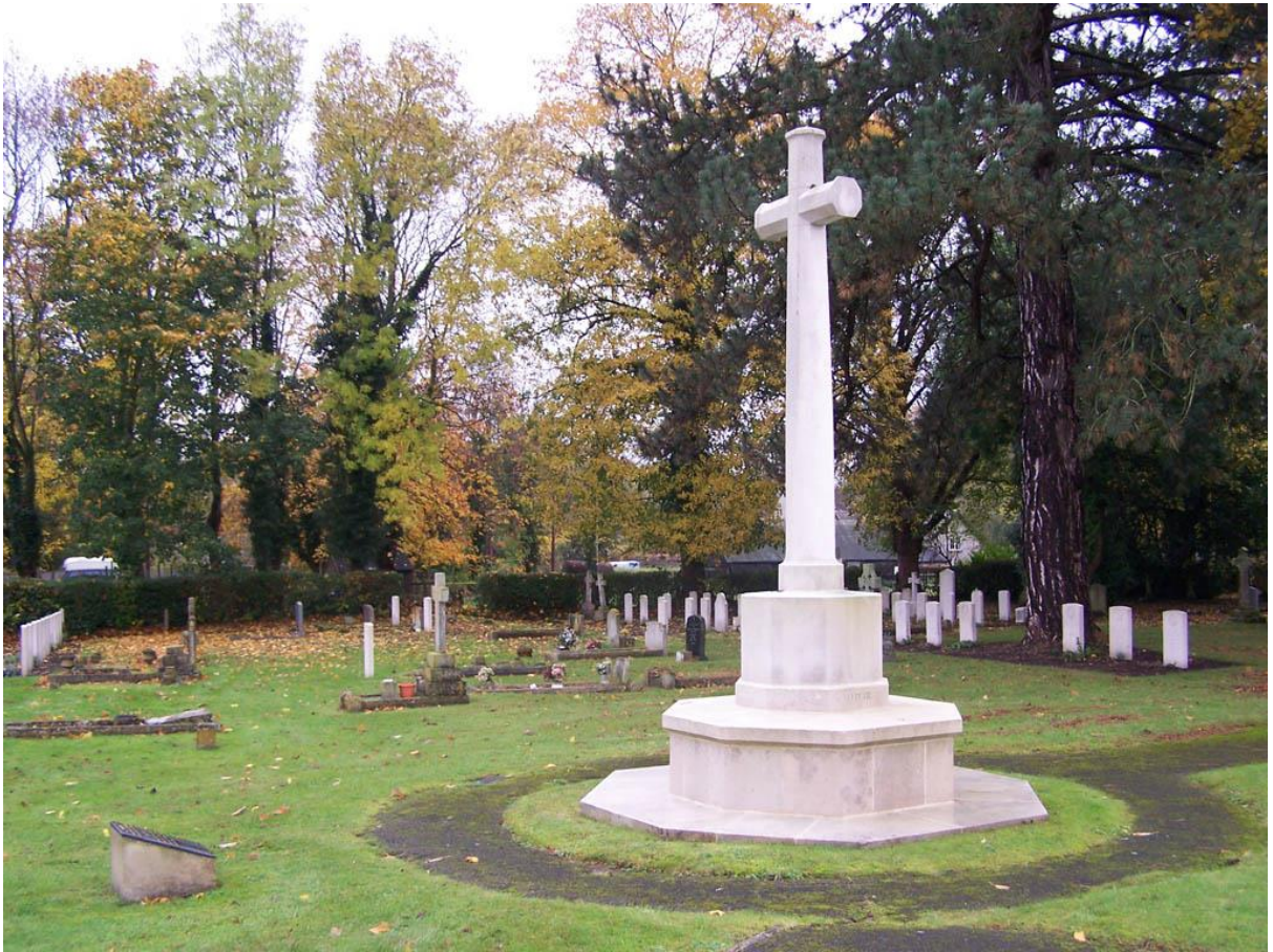
Bulford Church Cemetery