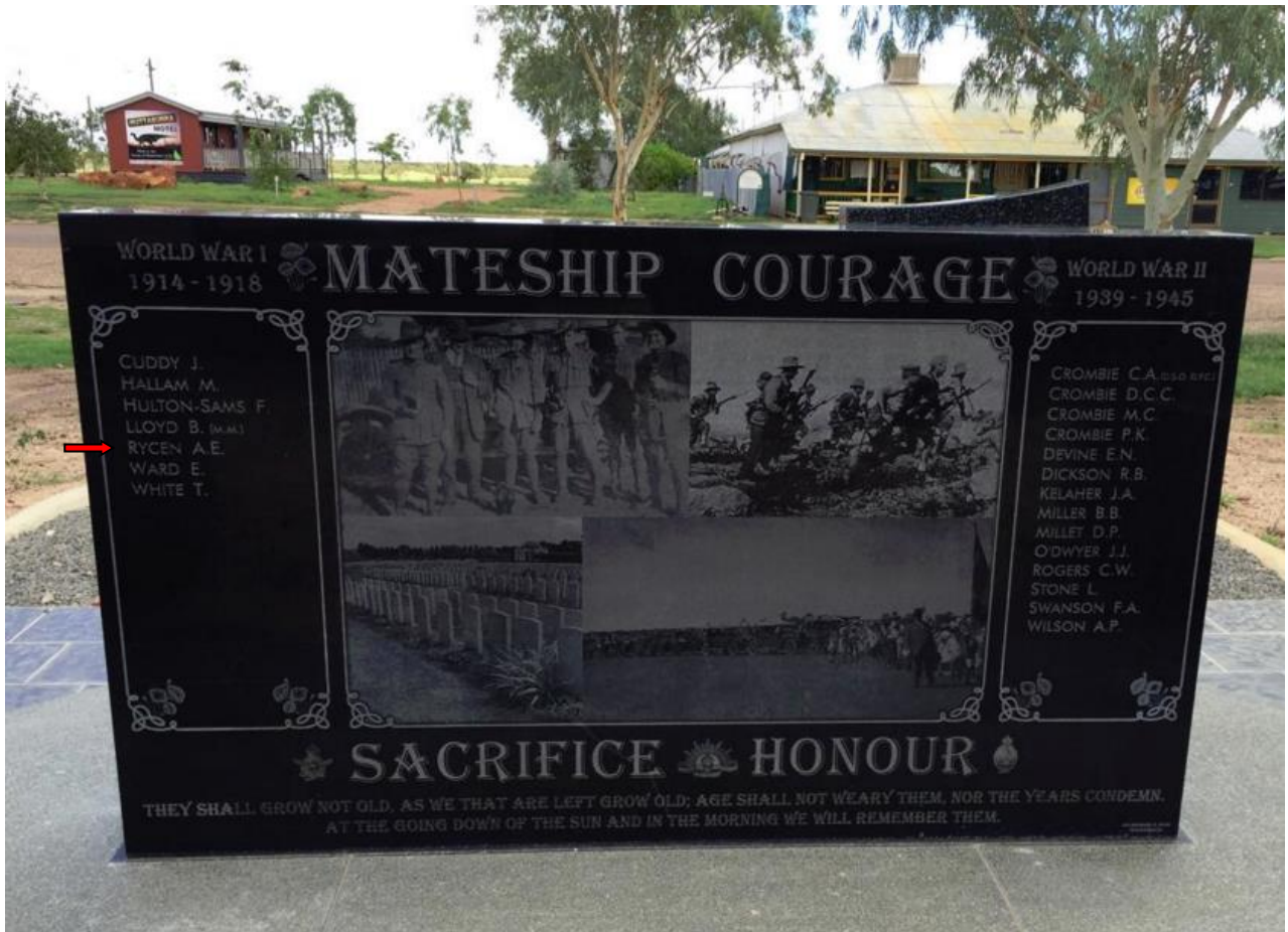
Muttaborra Cenotaph